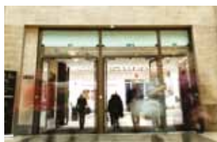
Automatic doors and Access control