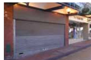
Industrial doors and Dock levellers