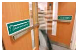
Emergency exit hardware