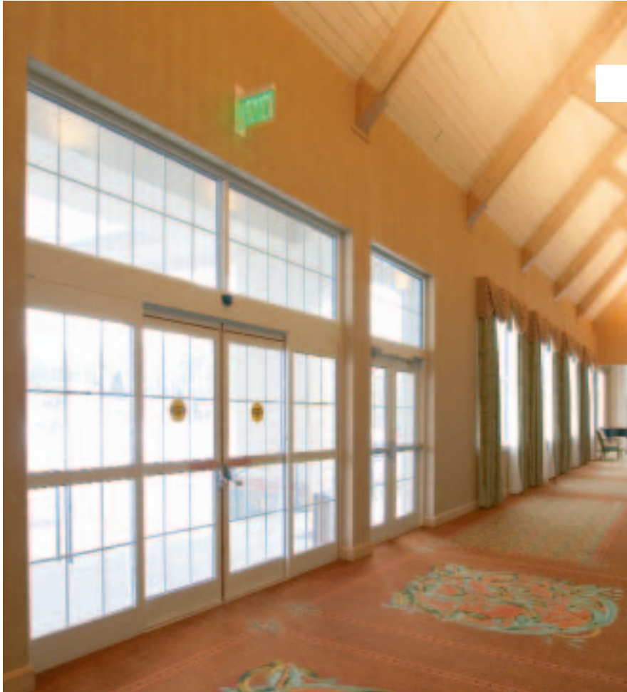
ESA-200 Narrow Stile (with optional emergency exit device)