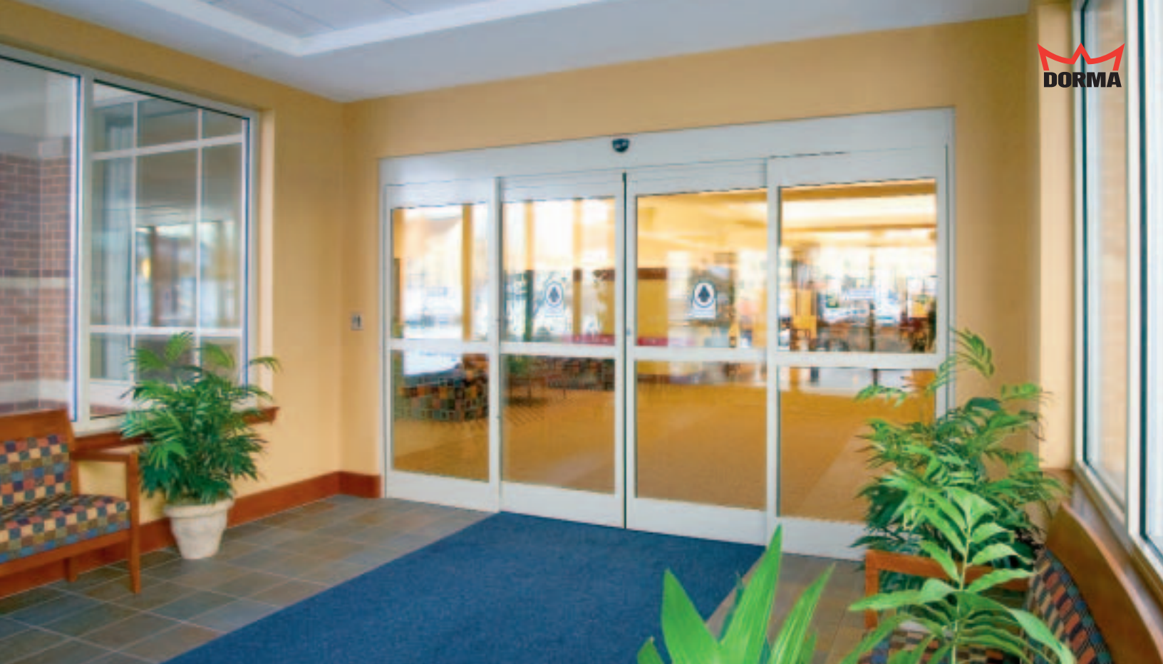
ESA-300 Narrow Stile