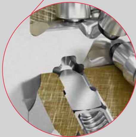
The movable security element in the key aligns with the security elements in the lock cylinder.