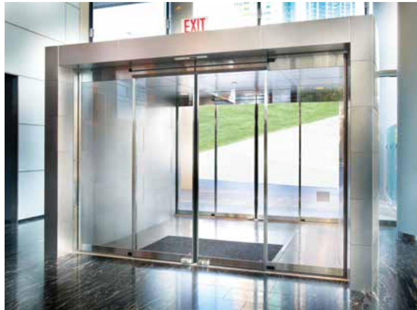
ESA400 Fine Frame Exterior (top) and Interior (above)

Related Companies Luxury Apartments 500 Lake Shore Drive – Chicago, IL Architect: Solomon Cordwell Buenz