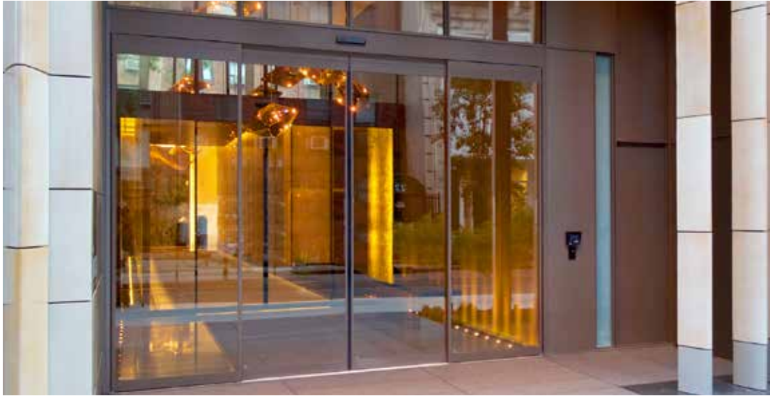
ESA400 Fine Frame 1 Madison Avenue – New York, NY