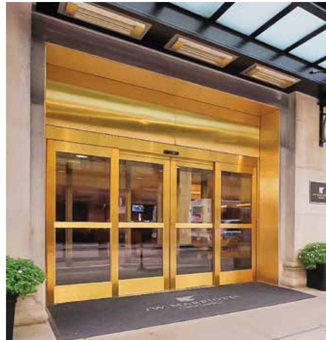
ESA300 with Clad Bronze Finish JW Marriott Chicago – Chicago, IL Architect: Lucien Lagrange & Assoc.

We couple modern technology with old world craftsmanship to manufacture the finest architectural finishes of any manufacturer.