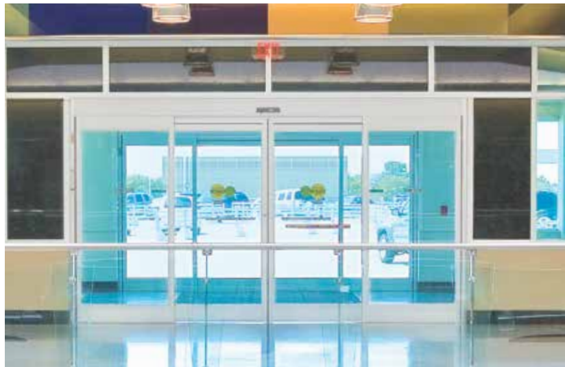
ESA200 Kansas City International Airport – Kansas City, MO