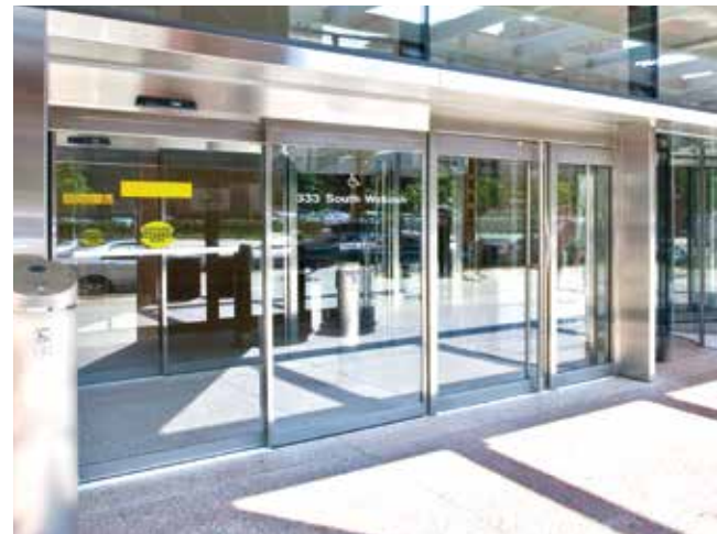
The already stylish ESA400 Fine Frame and ESA500 All Glass doors make elegant entrances when clad in a dormakaba ornamental architectural finish. (Brushed stainless steel cladding shown above.)