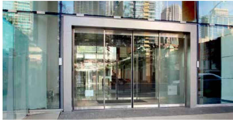
The ESA400 is the only automatic sliding door in the industry to come factory glazed.

The unparalleled choice of finishes dormakaba offers allows you to match your ESA400 precisely to your design. In addition to wet paint, powder coat, and anodized finishes, a variety of ornamental architectural metals can be applied by dormakaba's own craftsmen to create a spectacular entrance.