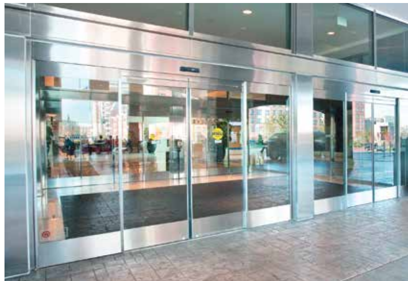
Gaylord National Resort & Convention Center – Washington DC Architect: Gensler