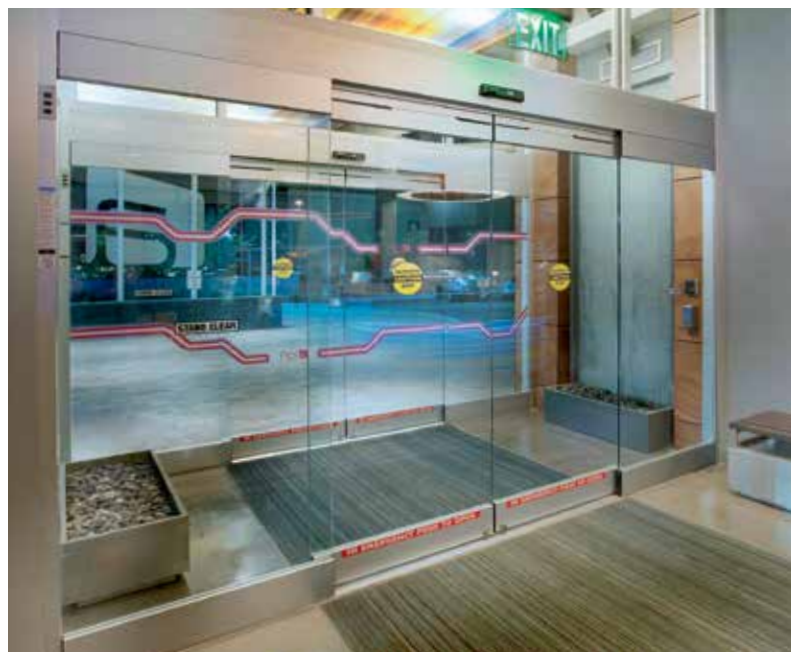
Aloft Detroit at The David Whitney – Detroit, MI Architect: Kraemer Design Group PLC