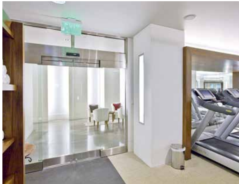
MGM Grand Casino Hotel – Detroit, MI