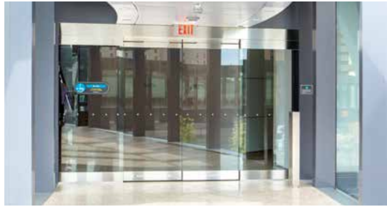
The Bow Office Tower – Calgary, Alberta Architect: Gensler

The ESA500 has a five-function program switch, adjustable motion sensor, and optional self-closing side panels.