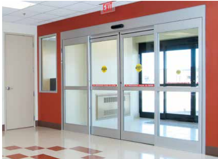
ESA200 Little Colorado Medical Center – Winslow, AZ Architect: Mittelstaedt, Cooper & Associates

dormakaba ESA doors couple rugged door panel construction with a smart design. Our uniform glass stops are designed to maintain consistent sightlines and daylight openings from door panel to door panel. This ensures that sliders using different glass within a vestibule will maintain the same daylight openings.