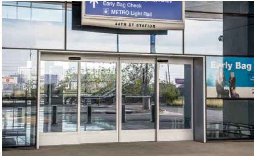
ESA300 PHX Sky Train – Phoenix, AZ Architect: HOK