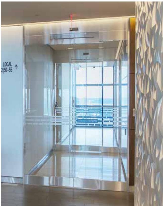
The Bow Office Tower – Calgary, Alberta Architect: Gensler