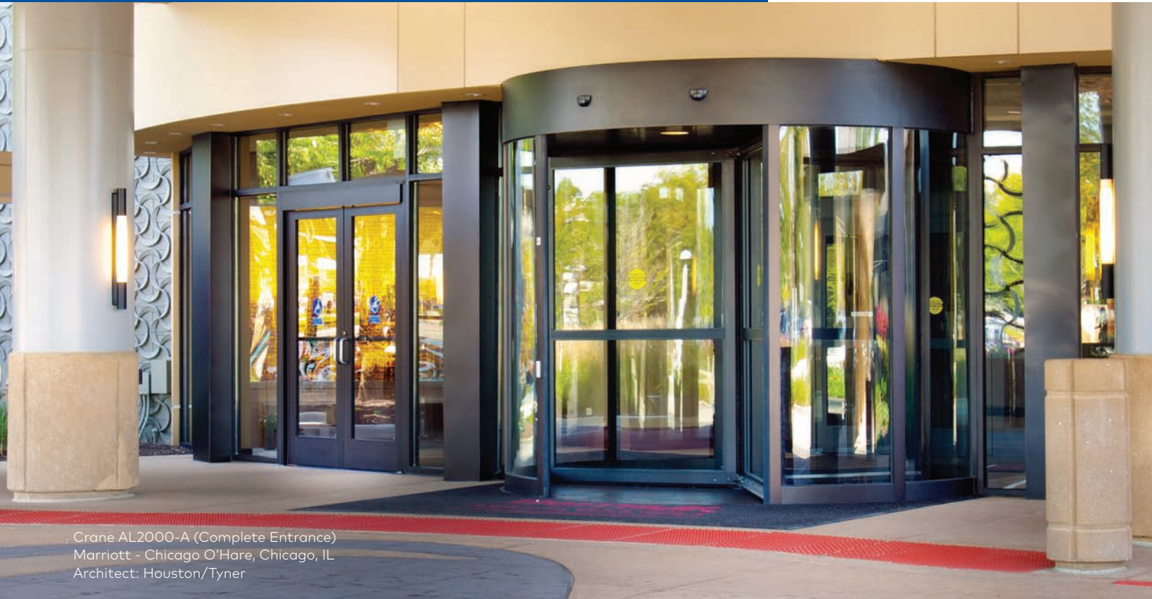
Crane AL2000-A (Complete Entrance) Marriott - Chicago O'Hare, Chicago, IL Architect: Houston/Tyner

The 2000-A Series features the torque-driven Crane Modular Drive System. The reliable advanced microprocessor control monitors the door and occupants to ensure safe operation.