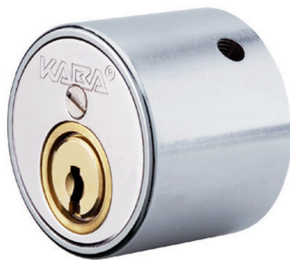
"SCAND" surface finish option