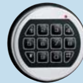
3750-K Round Entry, Audit & eKey II