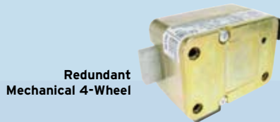
Redundant Mechanical 4-Wheel