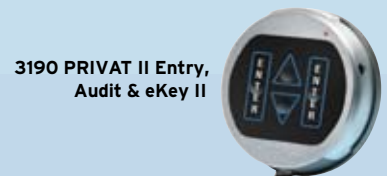
3190 PRIVAT II Entry, Audit & eKey II