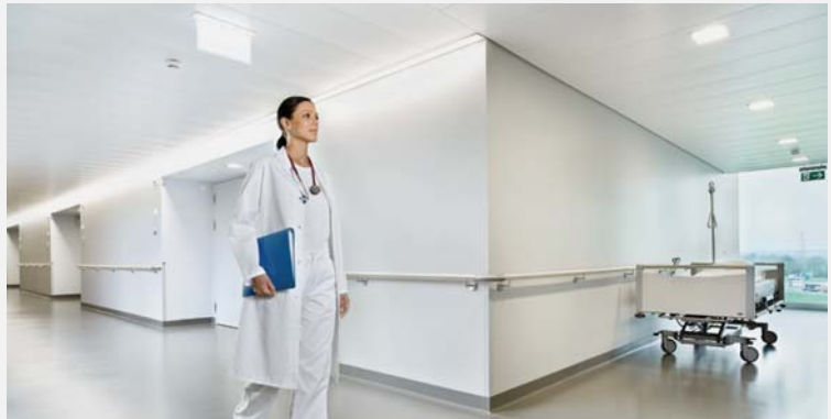
An Enterprise-class Solution B-COMM by Kaba