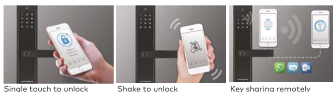
Single touch to unlock