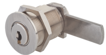
dormakaba K31 Camlock