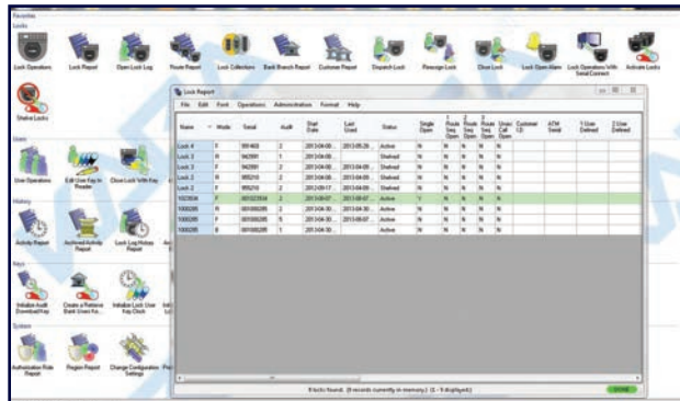
Main menu screen for Cencon Software

We are acutely aware that a large part of the ATM cash security investment comes from the hardware costs and operational expenses. Financial organizations already own the locks and keys. Cencon O 2 was designed with this in mind. The system provides an upgrade to your existing Gen2 locks and keys. From the field, your system is upgraded with a simple firmware update, our new Interconnect Box and software enhancements.